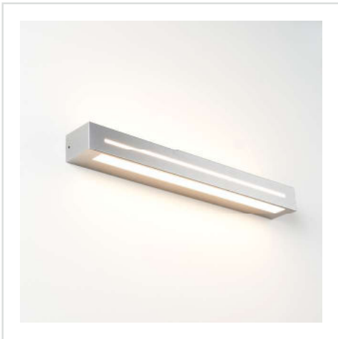
Viceroy SLT LED