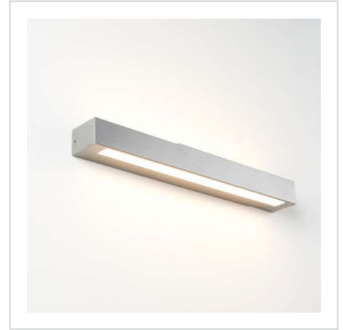
Viceroy UDL LED