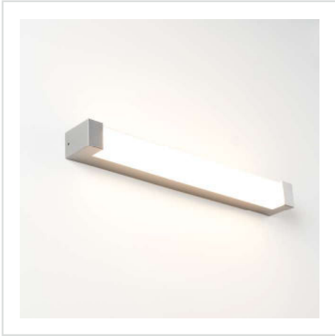
Viceroy STD LED