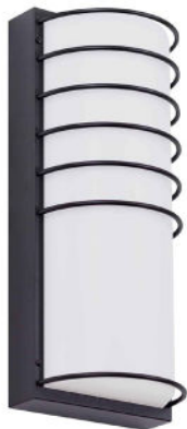
Royal EB STD ( Blank )