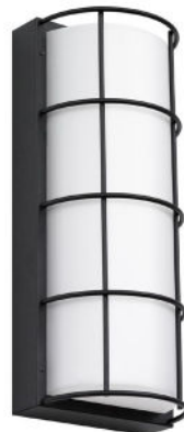
Royal EB SQR