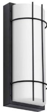
Royal EB VHT