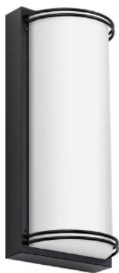
Royal EB TEB