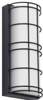
Royal EB FLD