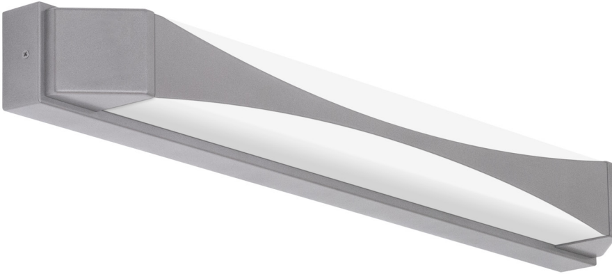
Shown w/ Optional TWC Trim