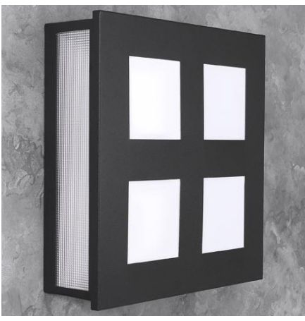
COMPACT FLUORESCENT & HID