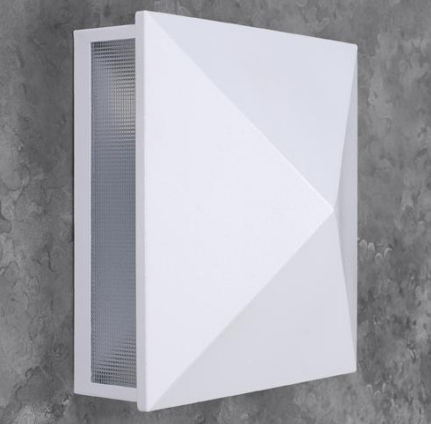
Textured White Finish Shown