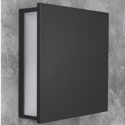
COMPACT FLUORESCENT & HID