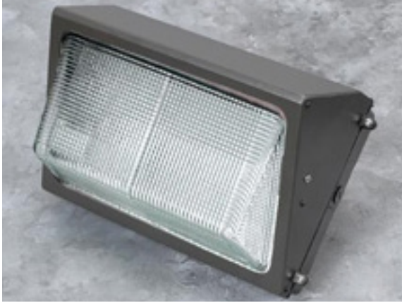
COMPACT FLUORESCENT & HID