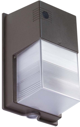
COMPACT FLUORESCENT & HID