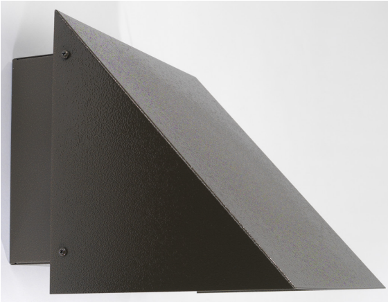
COMPACT FLUORESCENT & HID