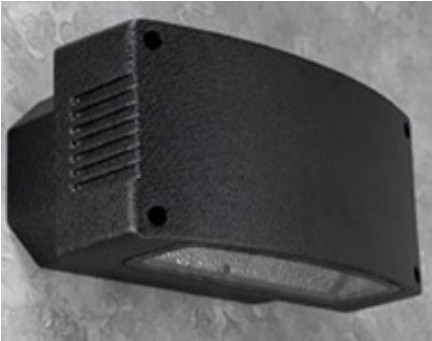
COMPACT FLUORESCENT & HID