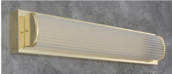
COMPACT & LINEAR FLUORESCENT