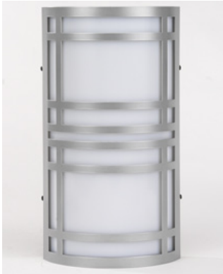
COMPACT & LINEAR FLUORESCENT