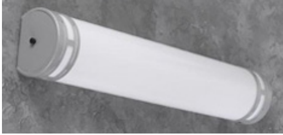
COMPACT & LINEAR FLUORESCENT