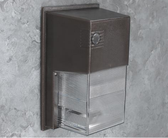
COMPACT FLUORESCENT & HID