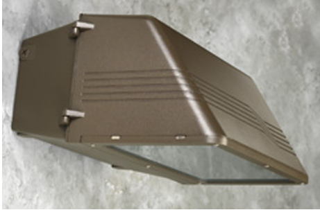
COMPACT FLUORESCENT & HID