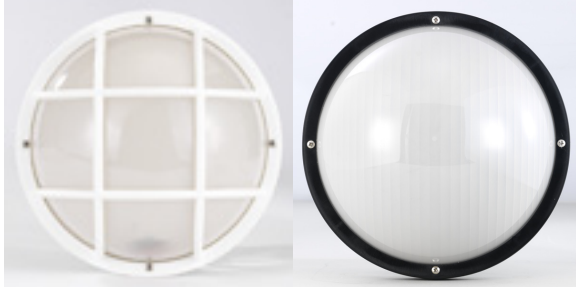
White and Black Finishes Shown