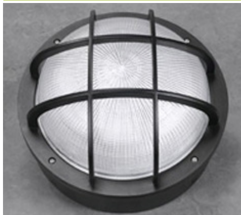
COMPACT FLUORESCENT & HID