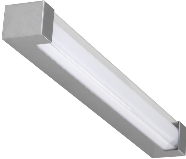
Standard Housing Shown