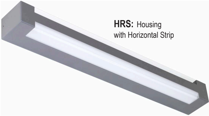
HRS: Housing with Horizontal Strip