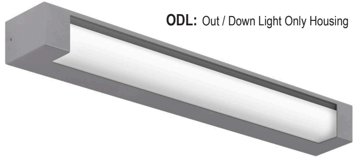
ODL: Out / Down Light Only Housing