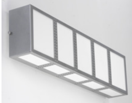
Matte Silver Finish Shown