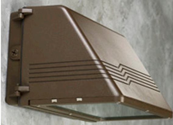
COMPACT FLUORESCENT & HID