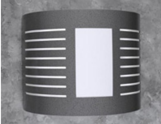
COMPACT FLUORESCENT & HID