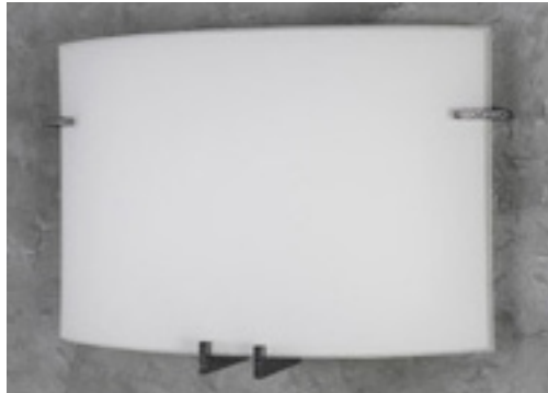
Swedish Steel Finish Shown