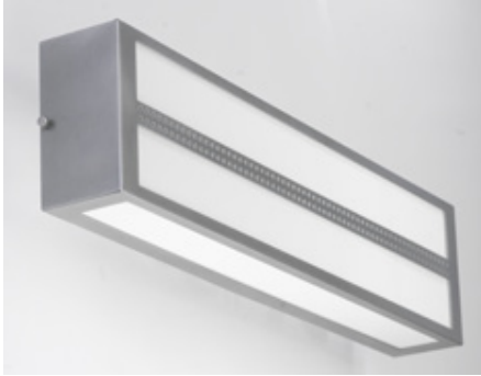
Matte Silver Finish Shown LINEAR FLUORESCENT