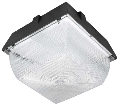
COMPACT FLUORESCENT & HID